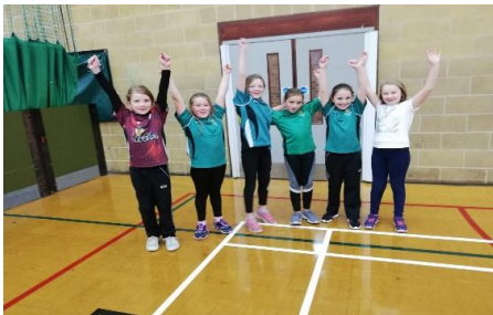
Girls U11 at WWJC Indoor Festival