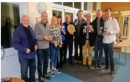
Senior Awards Ceremony

Seniors (over 14 years, men & women), has generally been excellent, despite and in common with many clubs, struggling to get players for the Saturday and Sunday teams. However, the teams still managed strong performances in each of the leagues. The 1 st Team finishing 6 th , the 2 nd Team finishing 14 th and the Midweek 1 st Team were League Champions.