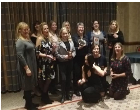
Part of Women's Cricket Squad at HCL Awards Ceremony

As well as taking part in the All Stars programme RCC has run Chance to Shine coaching, a Girls and Women's event, girls under 11 WWJC indoor festival and the Rainbow Central U16s (bringing girls together to play WWJC Indoor festival, who belong to clubs but do not have enough girls to make a team). The U11A's reached the Oliver Cup Final, the U15A's reached the Millard Cup final and congratulations to the U13B's for winning the league and becoming Champions.